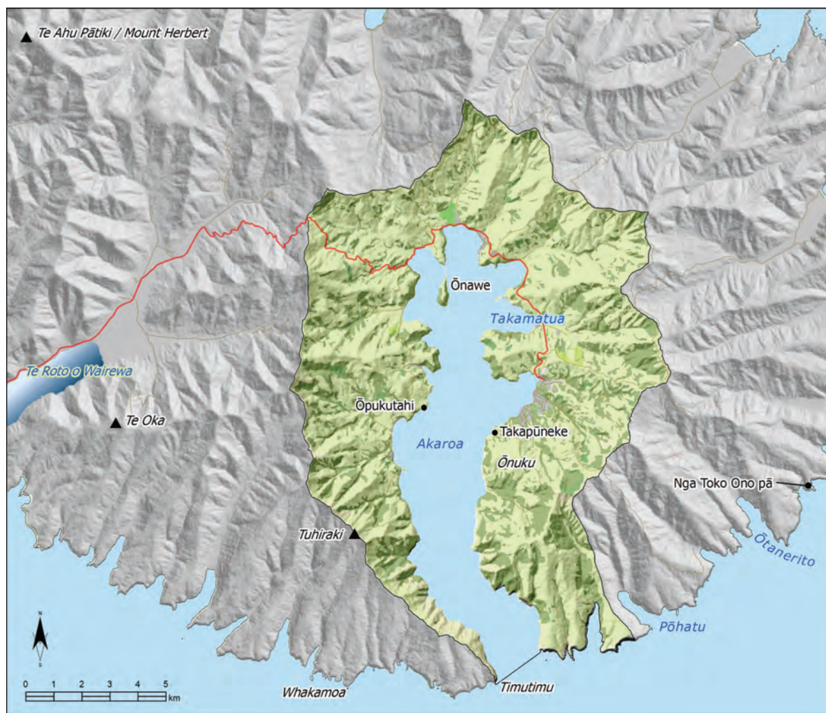
Map 17: Akaroa Harbour

NOTE: See Section 5.1 (Issue K1 - Recognising Manawhenua) for guidance on identifying the Papatipu Rūnanga with manawhenua and kaitiaki interests in this area.