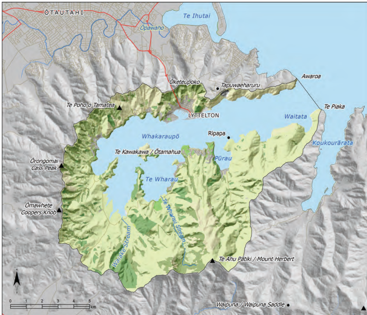
Map 15: Whakaraupō

NOTE: See Section 5.1 (Issue K1 - Recognising Manawhenua) for guidance on identifying the Papatipu Rūnanga with manawhenua and kaitiaki interests in this area.