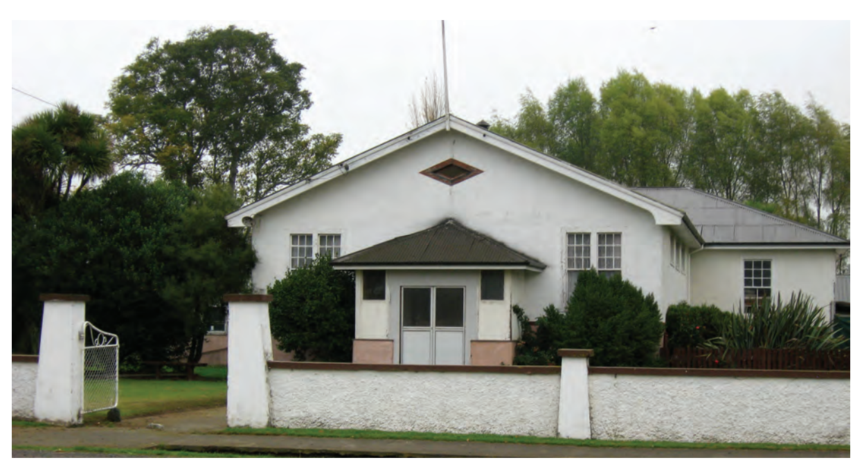
Photo: Maahunui, also known the Tuahiwi Hall.

Under the 1848 Canterbury Purchase the largest block of reserved land set aside for Ngāi Tahu was the Kaiapoi Māori Reserve 873. However, as a result of the land being granted by the Crown, traditional customary rights were uncertain giving rise to a need for title clarity for tribal members and whānau. In response to this need our people decided to establish a tribal council or Rūnanga to determine issues of property and how they would collectively live upon the Reserve. In 1859 the Kaiapoi Rūnanga was established. It was to be the first Rūnanga in New Zealand. The Rūnanga constitution was clear that it was a meeting of land owners decided in common by the people and confirmed under the 1862 Crown Grants Act. Since its establishment the Kaiapoi Māori Rūnanga has often been referred to as the Tuahiwi Rūnanga and latterly as the Ngāi Tūāhuriri Rūnanga as stated in the 1996 Te Rūnanga o Ngāi Tahu Act.